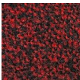
Red pepper SDN 76