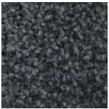
Midnight Grey SDN 64